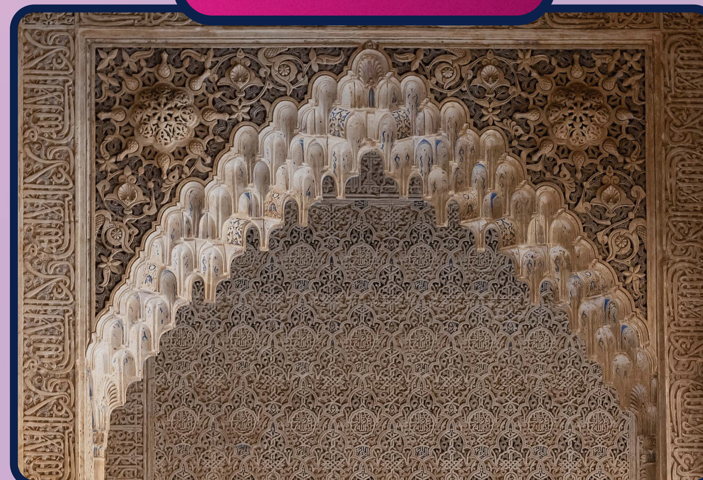
Nasrid Palaces, (1300s)