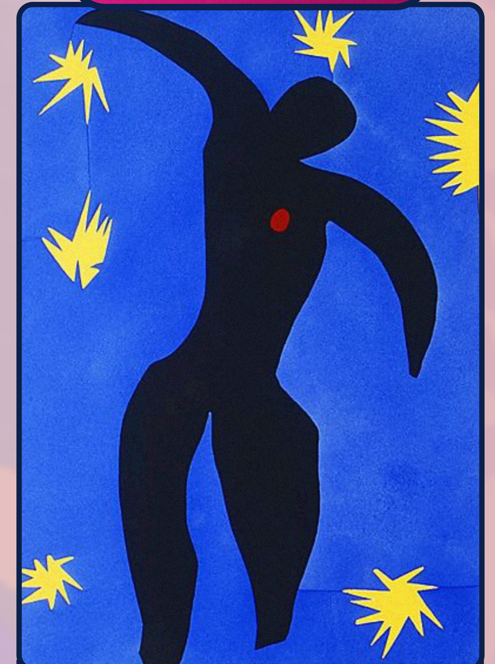
The Fall of Icarus, 1947

© 2021 Succession H. Matisse / Artists Rights Society (ARS), New York