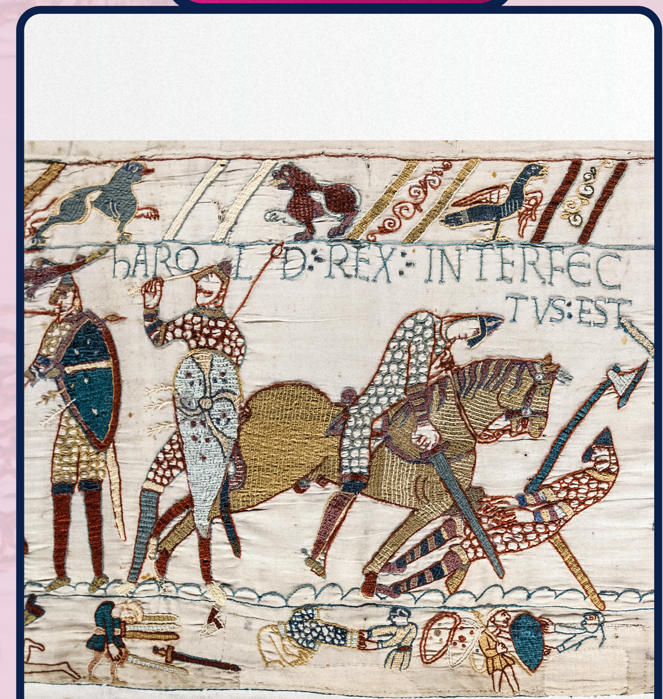
Extract from The Bayeux Tapestry showing Harold being shot in the eye