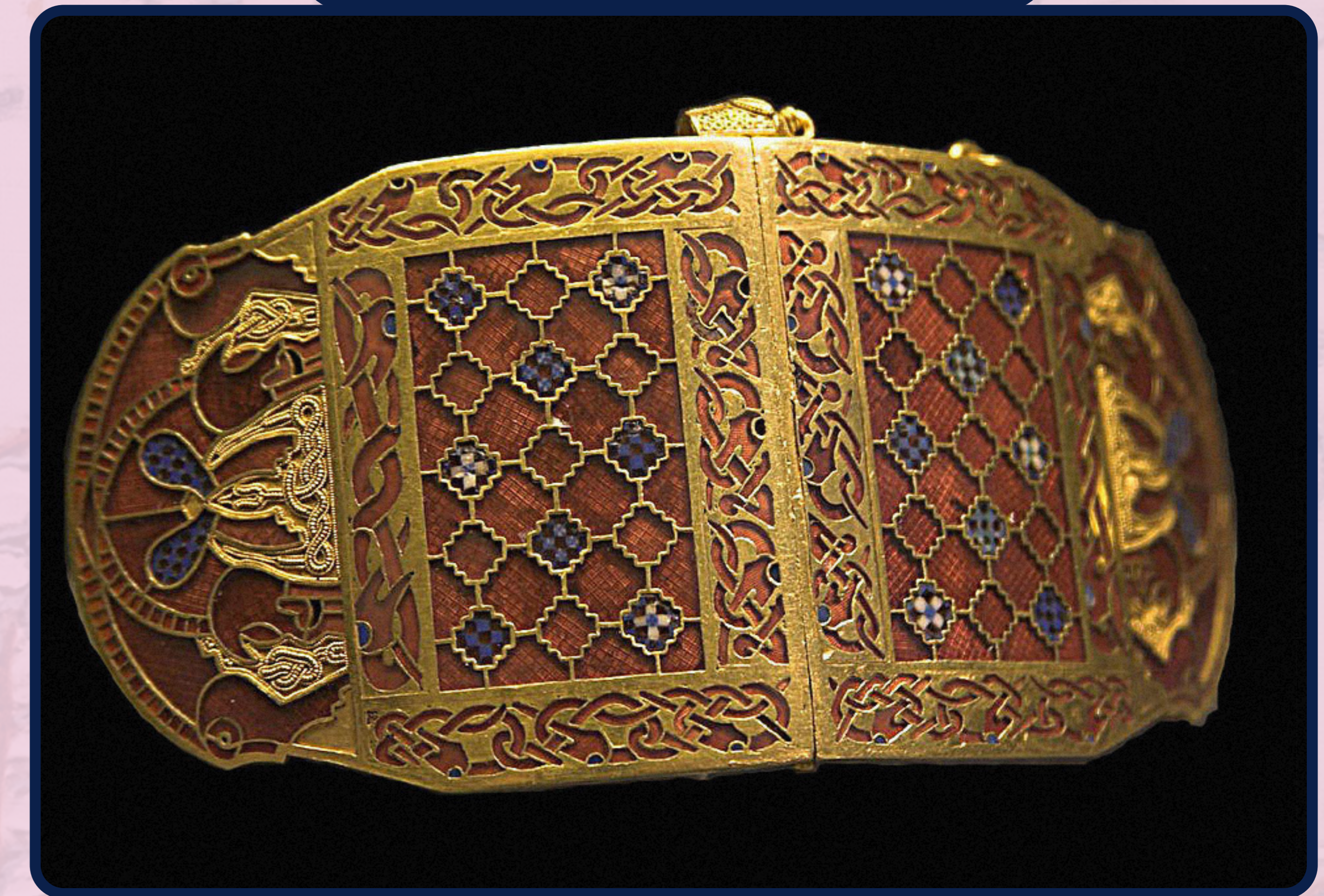
Shoulder clasp found at Sutton Hoo